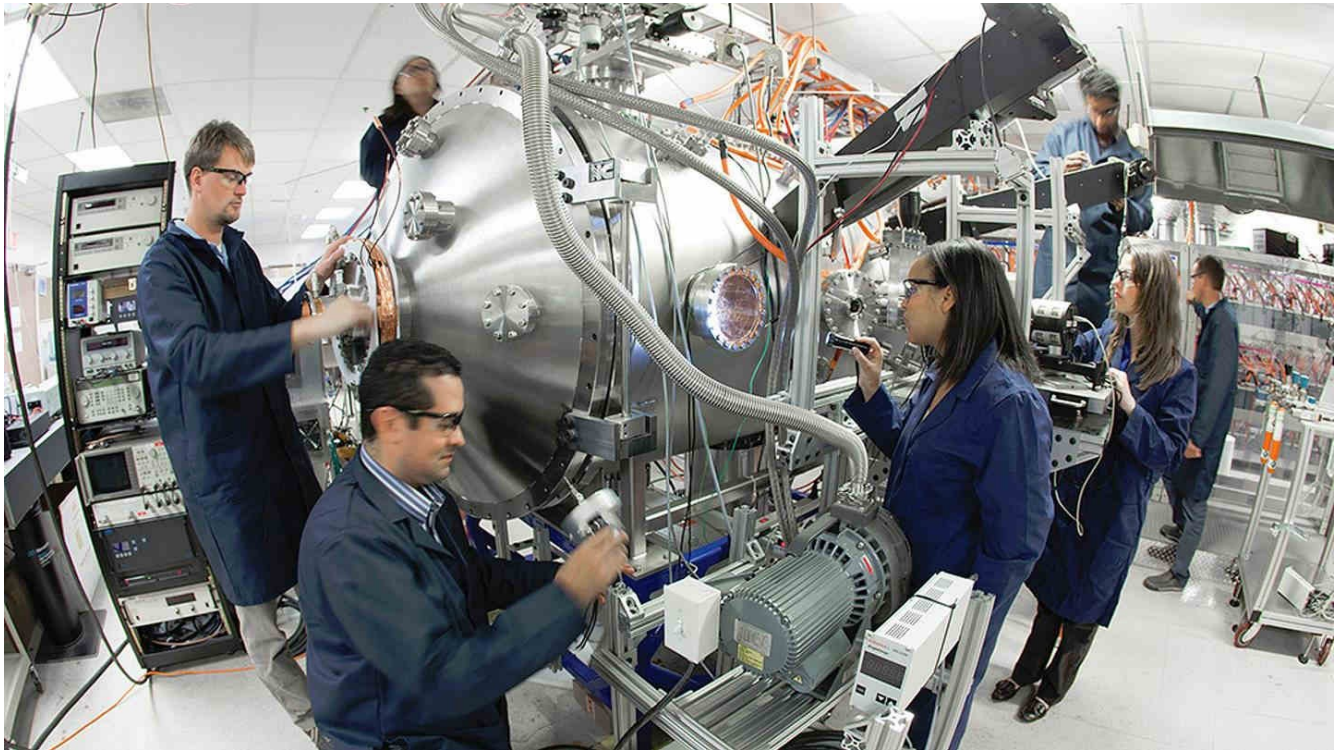
The future is now .... 200MW Compact Fusion Reactor [CFR] ... http://www.icausainc.com/power.html